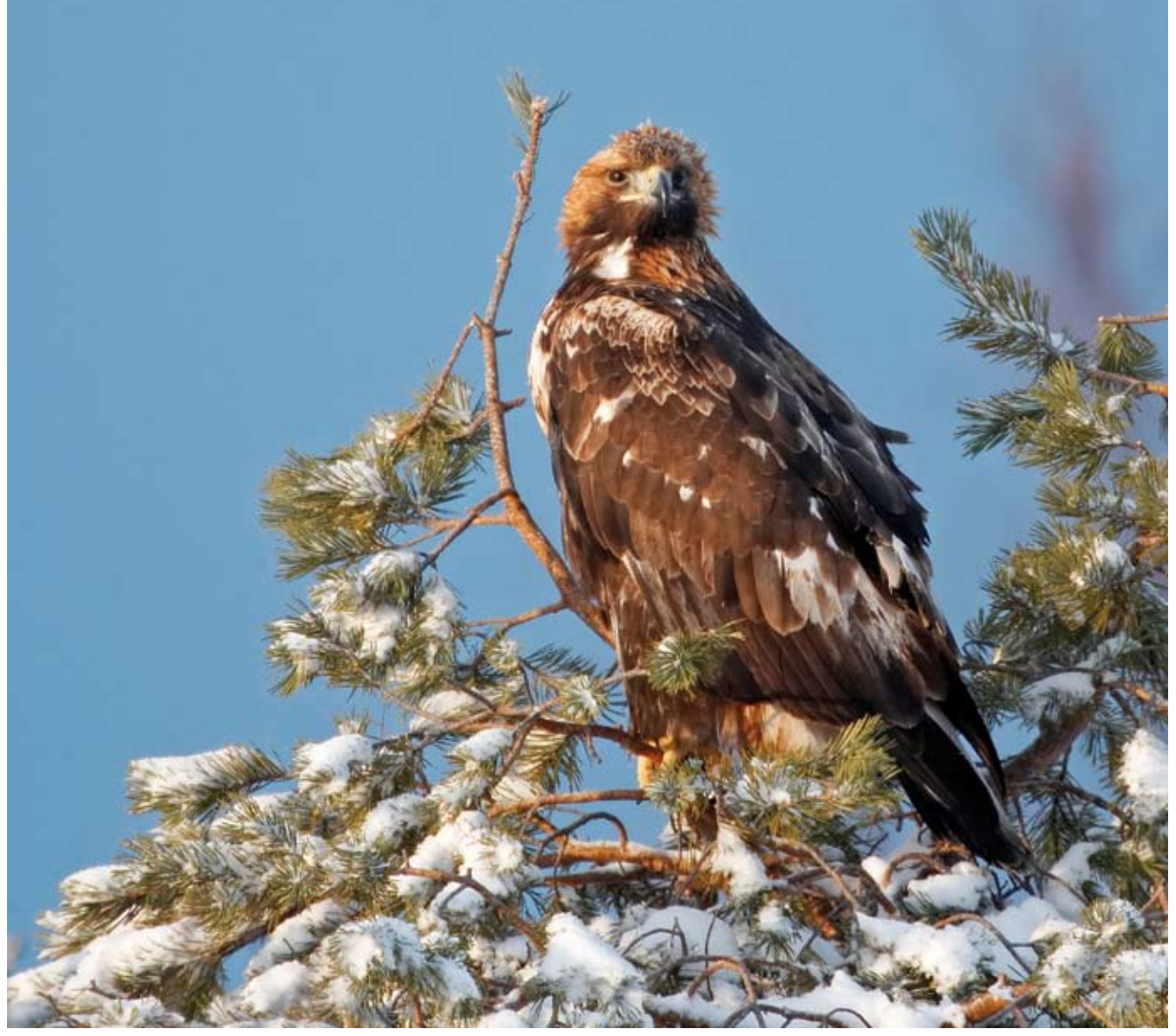
Golden Eagle Aquila chrysaetos. It is worth putting up suitable trees for the eagles to sit on at the correct distance from the hide. The pine in this picture is natural and a little too far from the hide. Canon I D Mark II N, 500 mm F4 + 2 X teleconverter, manual focus, ASA 320, 1/200, F8, videohead attached to a board in the hide, stabiliser in use. Utajärvi, Finland 25 January 2006.

The taiga forest is covered by snow for much of the winter and for the landscape photographer Kuusamo offers spectacular views. But the forest is rather quiet and only a few species are seen daily. But it is possible to increase this number considerably by visiting a few bird feeders. In winter, the birds minimise their movements and spend all the daylight hours feeding. Feeders offering varied food throughout the winter may be a necessity in the Finnish winter. Therefore, many feeders are also excellent locations for bird photography. A feeder placed in a well-lit corner of the forest makes it possible to photograph birds at least for a few hours daily, even in the darkest period.