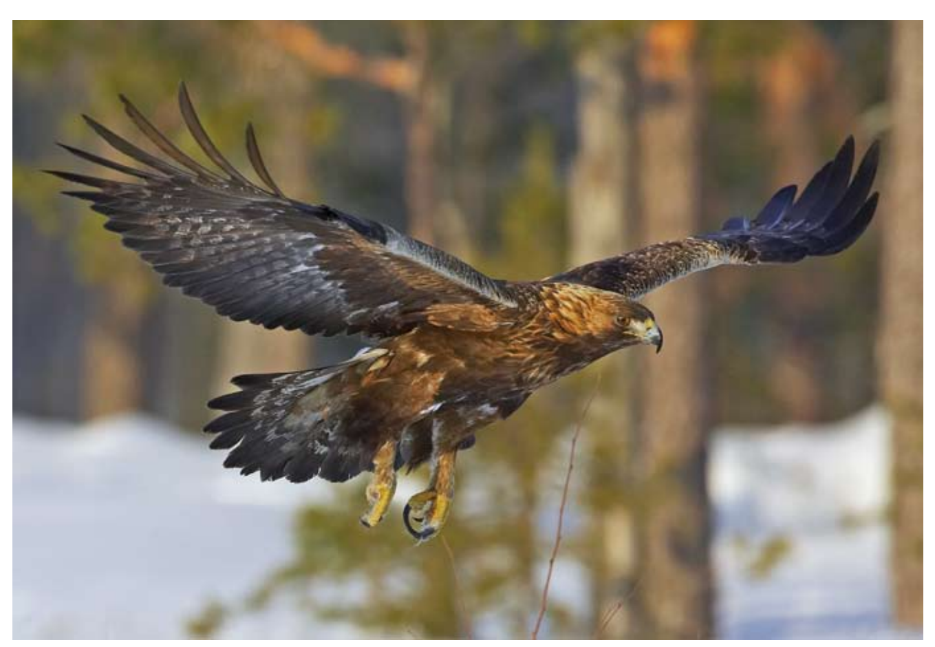
Golden Eagle. In late winter there is plenty of light even to photograph birds in flight. It is necessary to be careful while taking flight photos from the hide and moving the lens, as raptors are shy. Canon I D Mark II, 500 mm F4, 45 one point continuing autofocus, ASA 320, I/2000, F5.6, videohead attached to a board in the hide, stabiliser in use. Posio, Finland I5 March 2005.