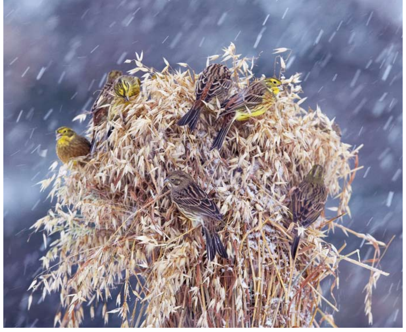
Yellowhammer Emberiza citrinella. It is worth placing the bird feeder so that the visiting birds can be photographed from a warm car. A bean bag was used to stabilise the lens on the car window. The snowfall shows well against the dark background and shows as long streaks thanks to the long exposure time. Canon EOS 5D, 300 mm F2.8, manual focus, ASA 800, 1/60, F4 stabiliser in use. Liminka, Finland 2 January 2006.

After the shortest day of the year (21 December) the days quickly get longer and in February to March there is plenty