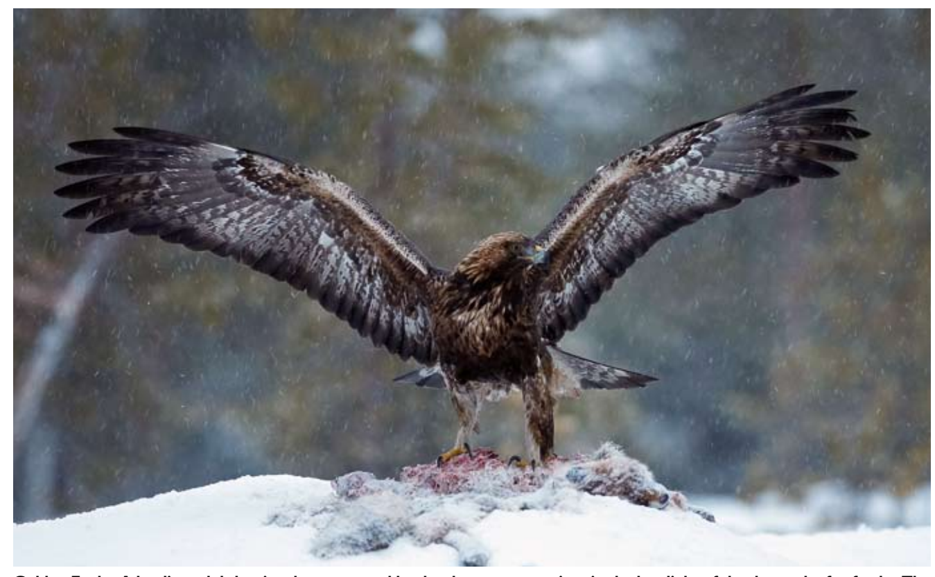
Golden Eagle. A landing adult has just been stopped by the slow exposure time in the last light of the day at the fox feeder. The snowfall shows nicely in short streaks against the dark background. Canon I D Mark II N, 300 mm F2.8, 45 one point continuing autofocus, ASA 800, I/125, F2.8, videohead attached to a board in the hide, stabiliser in use. Utajärvi, Finland 24 January 2006.