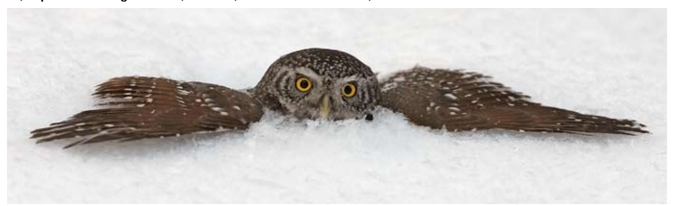
Pygmy Owl Glaucidium passerinum. Pygmy Owls turn up at bird feeders in winter and can be photogenic. It was possible to approach this owl, since it did not want to leave the prey it had dived into the deep snow after. Canon I D Mark II N, 300 mm F2.8, ASA 500, I/2000, F4, one point and one shot focus, handheld, stabiliser in use. Vaala, Finland I.3.2006.