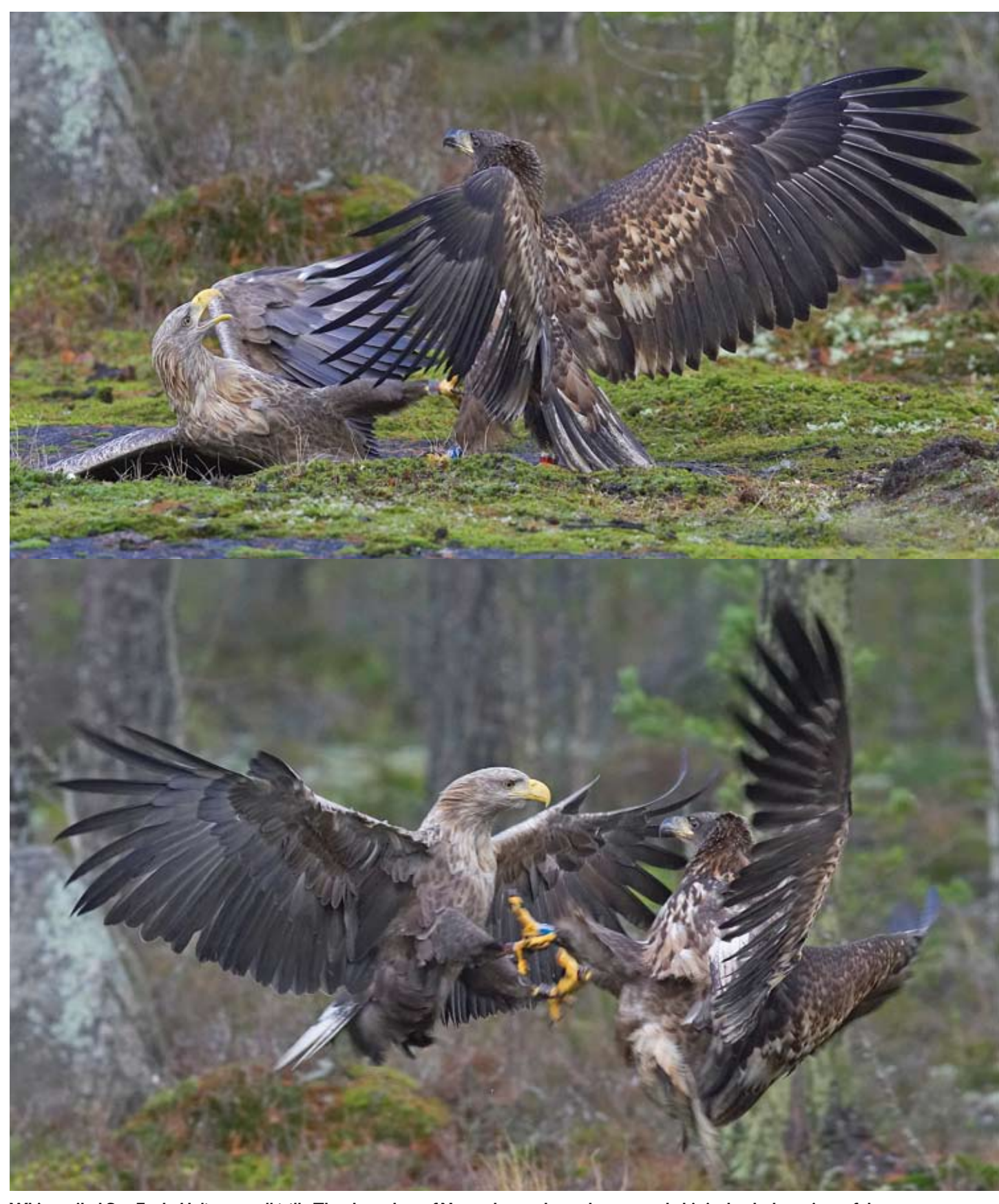
White-tailed Sea Eagle Haliaeetus albicilla. The short days of November and snowless ground; this is the darkest time of the year. Two days in the hide at the eagle feeder produced much material on White-tailed Sea Eagles. The raccoon dog found by the road and now tied in front of the hide inspired the eagles to fierce fights. As the autofocus easily picks up the pale areas I decided to focus manually even in fast situations. Because it is slow to focus manually I lost some good shots, however. Canon I D Mark II, 300 mm F2.8, manual focus, ASA 400, \triangle 1/320, F4, \triangle 1/250, F4.5, videohead attached to a board in the hide, stabiliser in use. Vehmaa, Finland I4 November 2004.