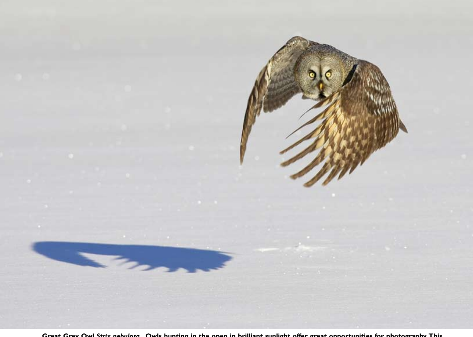
Great Grey Owl Strix nebulosa. Owls hunting in the open in brilliant sunlight offer great opportunities for photography. This picture is made interesting by the strangely shaped shadow of the owl showing on the snow. Canon I D Mark II, 300 mm F2.8, ASA 100, I/1000, F5, 45 point continuing focus, handheld, stabiliser in use. Liminka, Finland 8 March 2005.