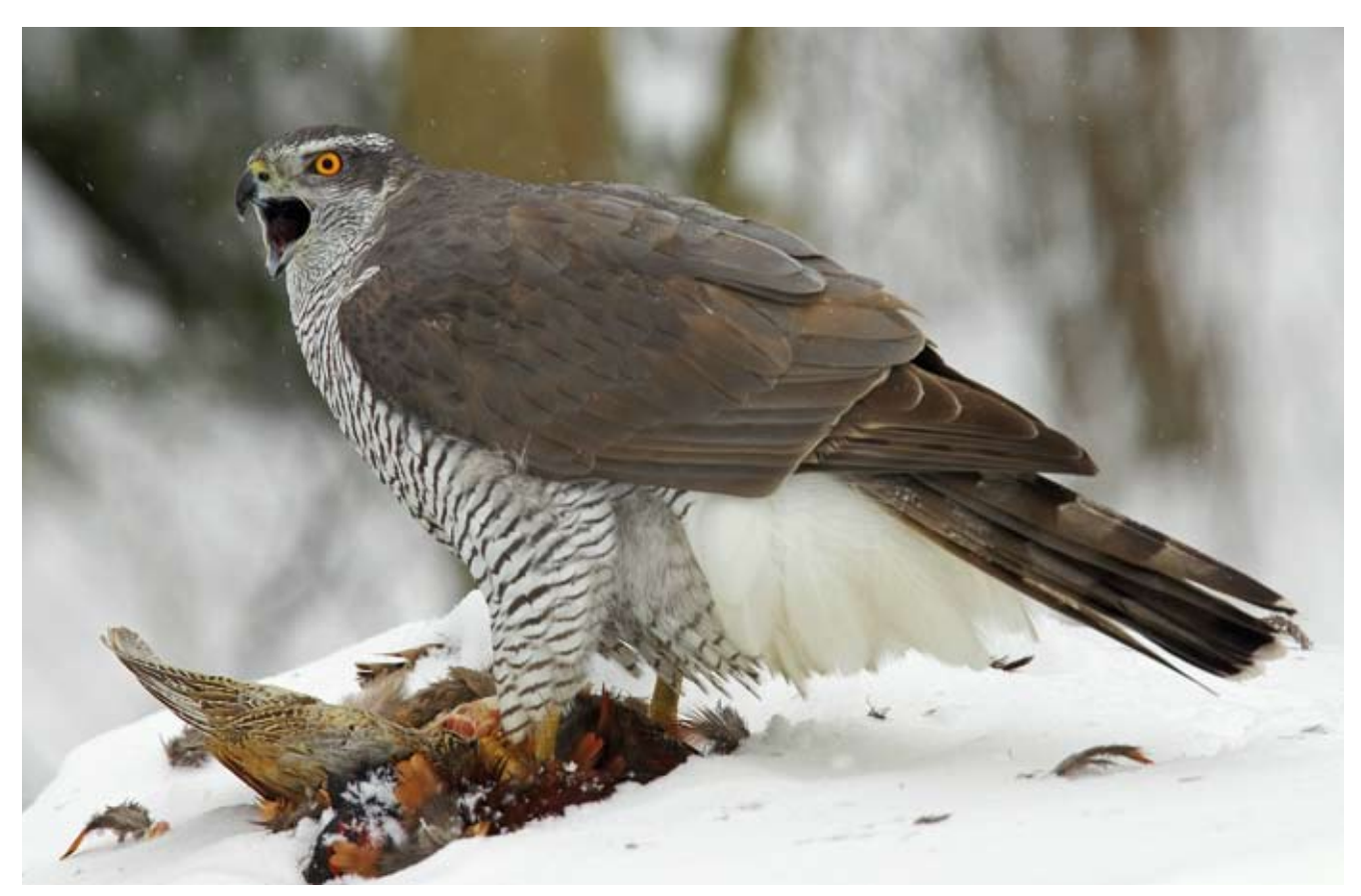
Goshawk Accipiter gentilis. The female, which has just landed at the feeder, is calling domineeringly as a juvenile Goshawk flies past. The picture was taken from a hide, where I spent all the hours of daylight. The Pheasant was placed and tied down at a suitable distance in the morning in the dark. This created an image of a difficult situation to photograph naturally, a Goshawk killing and eating a Pheasant. Canon I D Mark II, 300 mm F2.8 + 1,4 X teleconverter, manual focus, ASA 200, I/250, F7.1, videohead attached to a board in the hide, stabiliser in use. Lohja, Finland I4 February 2005.

A common belief is that because of its northern location Finland is pitch black in winter. However, up to at least the latitude of Oulu it is possible to photograph foraging owls in open areas even at the darkest time of the year in November to December. A songbird feeder placed in the open makes it possible to achieve a wonderful red tone to the photographs from the low sun of the winter's day.